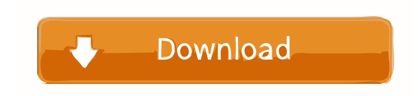
El Capitan For Dummies Pdf